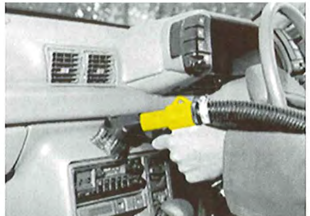
Ideally used for car detailing.

You can vacuum fluids with safety and there's no problem with electrical breakdowns or maintenance because it's air-powered.