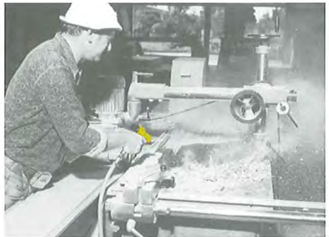
Blow cleaning sawdust from woodworking machine.

Granulated or liquid materials can be conveyed from one place to another via the duct hose. BV22 has unlimited possibilities in manufacturing plants.